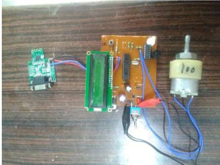
Fig 2.Vehicle Module