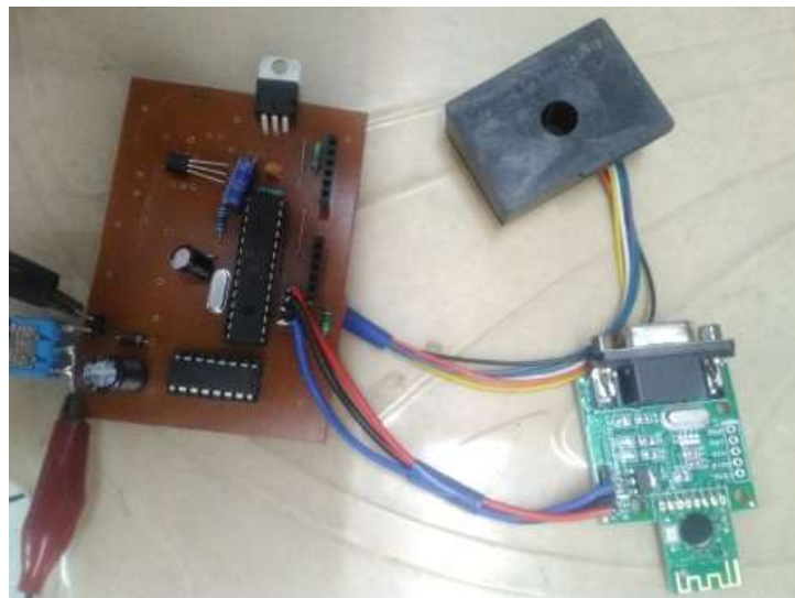
Fig 3.Environmental module